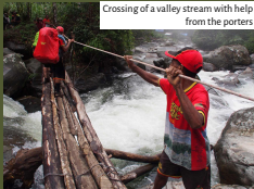
Crossing of a valley stream with help from the porters